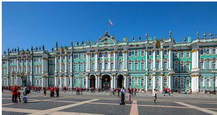
Russian Winter Palace, Now the Hermitage